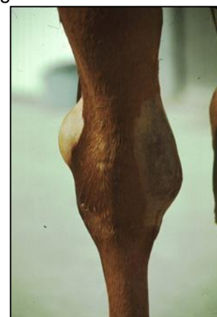
Distended hock joint "bog spavin"

Joint inflammation increases the amount of fluid in the joint and this usually causes visible and/or palpable bulging of the joint capsule (bog spavin, popped knee, windgall). However, not all joint swellings are due to arthritis. For example a simple strain may cause transient joint swelling. In arthritis, there is pain when the affected joint is flexed and the horse