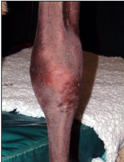
Swollen knee in horse with septic arthritis

Normal, painless joint function is essential for an athletic animal, and for this to occur, each component of the joint structure must be healthy and working properly. Smooth movement of the opposing bone ends is achieved by its complex structure: the special shape of the end of each bone, the covering of smooth cartilage over the end of each bone, the presence of synovial fluid ('joint oil') which lubricates the cartilage, all contained within the joint capsule which forms an elastic pouch that encloses the structures of the joint and, in some cases, contains supporting ligaments.